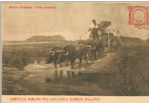
Image: ox cart in marsh Text: Circle of Evil by Enrico Coleman Notes: Price: E