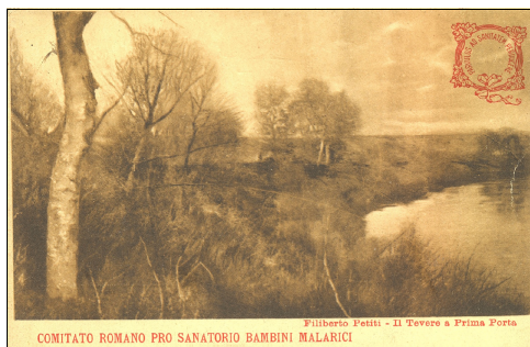
Image: stream Text: The Tiber at Prima Porta by Filiberto Petiti Notes: Price: E