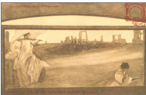
Image: fleeing a town in ruins Text: The Last Note by Giovanni Costantini Notes: cancelled Rome: January 13, 1912 Price: E