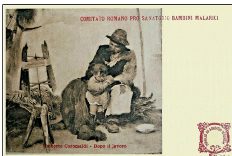
Image: man and child Text: After Work by Umberto Coromaldi Notes: Price: E