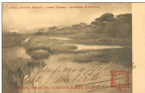
Image: swamp Text: Fusano Castle: The Levante Pond by Giulio Aristede Sartorio Notes: Price: E